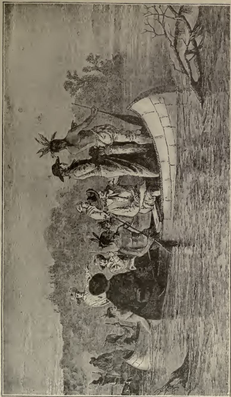
JOLLIET AND MARQUETTE DISCOVER THE MISSISSIPPI.